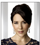
HRH The Crown Princess Mary